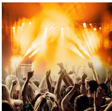
Bunker 700 m from the Montownia

A popular venue with a restaurant, music club and cocktail bar on the Motława at Chmielna 10 Street.