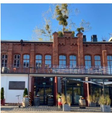
Mielżyński Gdańsk 900 m from the Montownia

This part of the city centre, full of historical monuments, charming streets, cafés and restaurants Gdańsk, has its beginning at Długa Street.