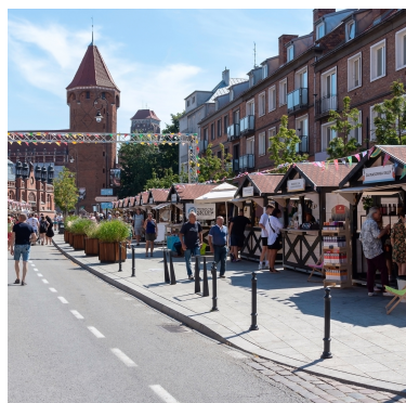
Dominican Fair 1.5 km from the Montownia

An entertainment, commercial and cultural event, which takes place every year in August in the Main Town on Długa Street.