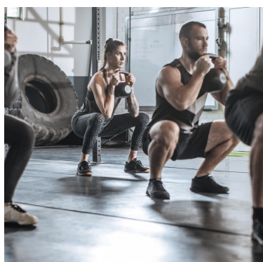
Crossfit Stocznia 850 m from the Montownia

A leisure and sports center next to the Polsat Plus Arena Gdańsk stadium, where there are many attractions for children, young people and adults. The attraction is located at Pokoleń Lechii Gdańsk 1 Street.