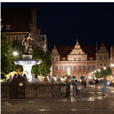
Main City 1 km from the Montownia

Built in 2011 at Pokoleń Lechii Gdańsk 1 Street, the football stadium together with the with recreational and sports centre Fun Arena.