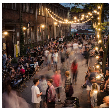
Elektryków Street 1.5 km from the Montownia

Poland's largest zoo, open all year round and covering an area of 125 hectares, home to over 160 species of animals from all over the world. The attraction is located at Karwieńska 3 Street in Gdańsk- Oliwa.