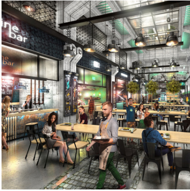
Food hall at the Montownia

A food hall on the ground floor of the MONTOWNIA with more than 20 restaurants serving cuisine from all over the world.