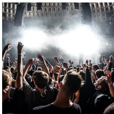
Tkacka Music Club 1.5 km from the Montownia

Music club in the centre of Gdańsk at Tkacka 9 Street, organising concerts by renowned artists and parties with DJs.