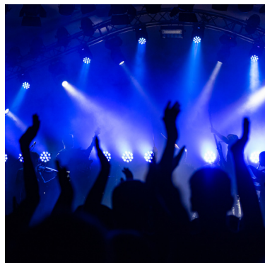
Sassy Gdańsk 1.8 m from the Montownia

Music club in the centre of Gdańsk at Tkacka 9 Street, organising concerts by renowned artists and parties with DJs.