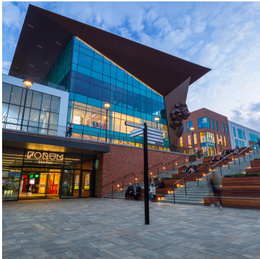
Forum Shopping Center 2 km from the Montownia

A food hall on the ground floor of the MONTOWNIA with more than 20 restaurants serving cuisine from all over the world.