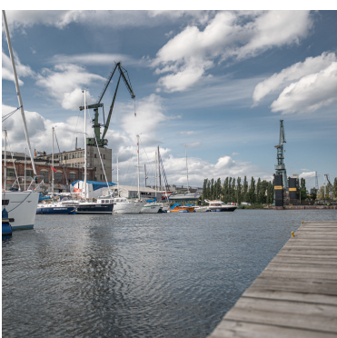
Imperial Harbour 600 m from the Montownia

Studio cinema and cafe in a basement with original medieval ceilings and restored seats. The attraction is located at Lektykarska 4 Street.