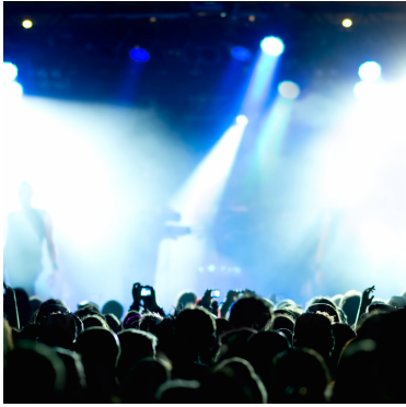
B90 1.5 km from the Montownia

The largest concert club in the Tri-City, located on the grounds of the former Gdańsk Shipyard in Elektryków Street, in the scenery of historic cranes.