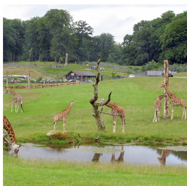
ZOO 12 km from the Montownia

Functional training center in Gdańsk located in the former "BioBazar" at Doki 1 Street, in the center of the historic shipyard areas.