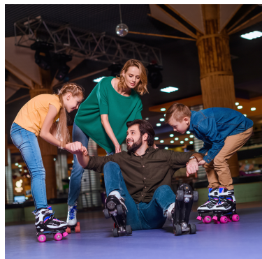
Fun Arena 5 km from the Montownia

An entertainment, commercial and cultural event, which takes place every year in August in the Main Town on Długa Street.