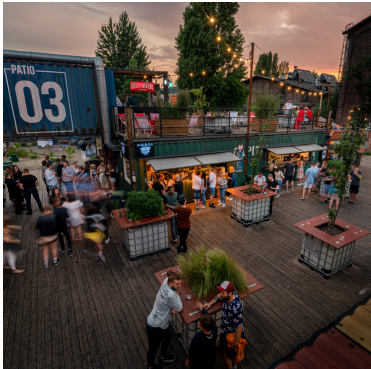
Shipyard "100cznia" 1.2 km from the Montownia

The largest concert club in the Tri-City, located on the grounds of the former Gdańsk Shipyard in Elektryków Street, in the scenery of historic cranes.