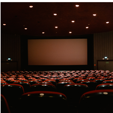
Cinema Cameral Cafe 1.5 km from the Montownia

A shopping mall in the center of Gdańsk with numerous shops, a catering area and an office centre. The attraction is located at Rajska 10 Street.