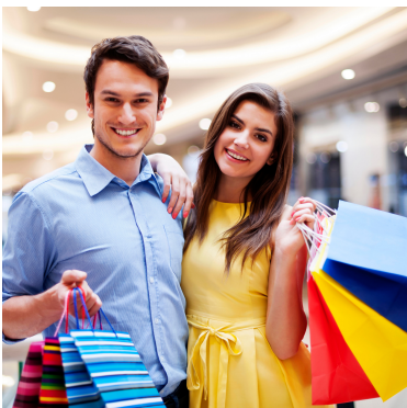
Madison Shopping Mall 750 m from the Montownia

A modern shopping centre opened in 2018 with many shops, a cinema, areas full of greenery and a car park. The 14th-century Radunia Canal flows beneath it. The attraction is located at Targ Sienny 7 Street.