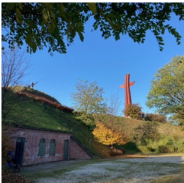
Grodzisko 2 km from the Montownia

Poland's largest zoo open all year round with an area of 125 hectares, home to over 160 species of animals from all over the world. The attraction is located at Karwieńska 3 Street in Gdańsk - Oliwa.