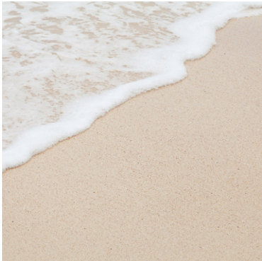
Brzeźno Beach 8 km from the Montownia

The beautiful, sandy beach is located near the city centre next to Wydmy 1 Street, it has a guarded swimming area.