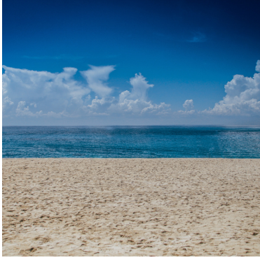
Sobieszewo Island (Sobieszewo) 20 km from the Montownia

A part of the city located by the Vistula River on the Bay of Gdańsk, it has a charming beach and a pine forest. The beaches on the Isle of Sobieszewo are among the widest and most beautiful beaches in Gdańsk.