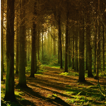
Tri-City Landscape Park 9 km from the Montownia

A part of the city located by the Vistula River on the Bay of Gdańsk, it has a charming beach and a pine forest. The beaches on the Isle of Sobieszewo are among the widest and most beautiful beaches in Gdańsk.