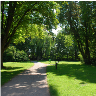
Steffens Park 2 km from the Montownia

A sandy beach with a walking pier and numerous attractions at Oksywska Street. Here you can make use of cycle paths, green areas, a volleyball pitch, a water slide volleyball court, water slide and rope park.