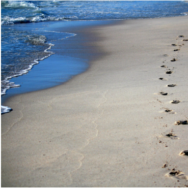
Stogi Beach 9 km from the Montownia

The beautiful, sandy beach is located near the city centre next to Wydmy 1 Street, it has a guarded swimming area.