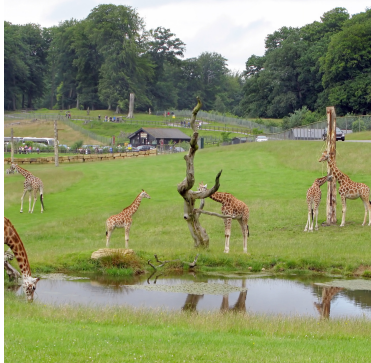
ZOO 12 km from the Montownia

The landscape park is located on the north-eastern fragment of the moraine upland of the Kashubian Lake District, and contains many walking and cycling trails. The park covers part of the area of Gdańsk, Sopot, Gdynia, Rumia, Wejherowo and Szemud.