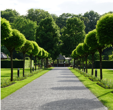
Oliwa Park 9 km from the Montownia

One of the largest: 13 ha and the oldest public park stretching along Victory Avenue. It was established at the end of the 19th century. The attraction is located at Towarowa 40 Street.