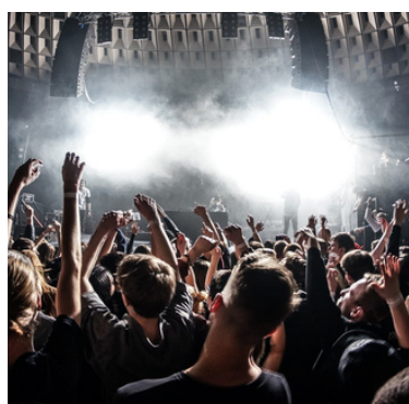
Tkacka Music Club 1.5 km from the Montownia

An entertainment club at Wały Piastowskie 24 Street, organising events dance parties of various themes.