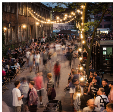
Elektryków Street 1.5 km from the Montownia

A music and catering space in the Gdańsk Shipyard with clubs, pubs and food tracks.