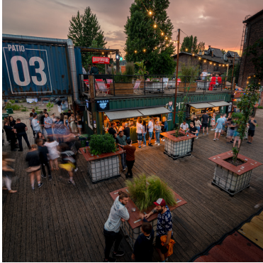
Shipyard 4 km from the Montownia

The largest concert club in the Tri-City, located in the former Gdańsk former Gdańsk Shipyard in Elektryków Street, in the scenery of historic cranes.