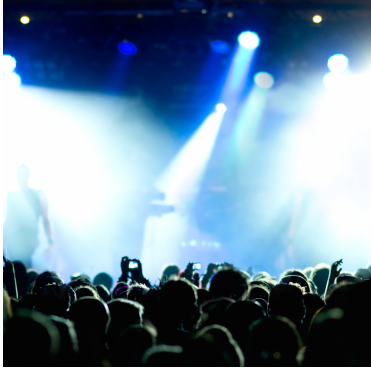
B90 1.5 km from the Montownia

The largest concert club in the Tri-City, located in the former Gdańsk former Gdańsk Shipyard in Elektryków Street, in the scenery of historic cranes.